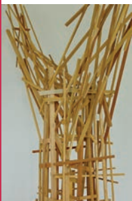
Exhibit ends October 28

Using a technique developed by the artist, people of all abilities will come together at the opening reception to build a work of art from wood. This sculpture they create will continue to "grow" throughout the length of the exhibit, so come back often to check on its progress!